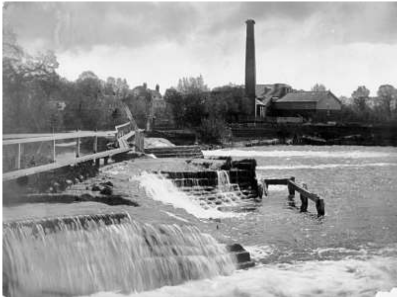
The weir in 1880 with the mill chimney in the background