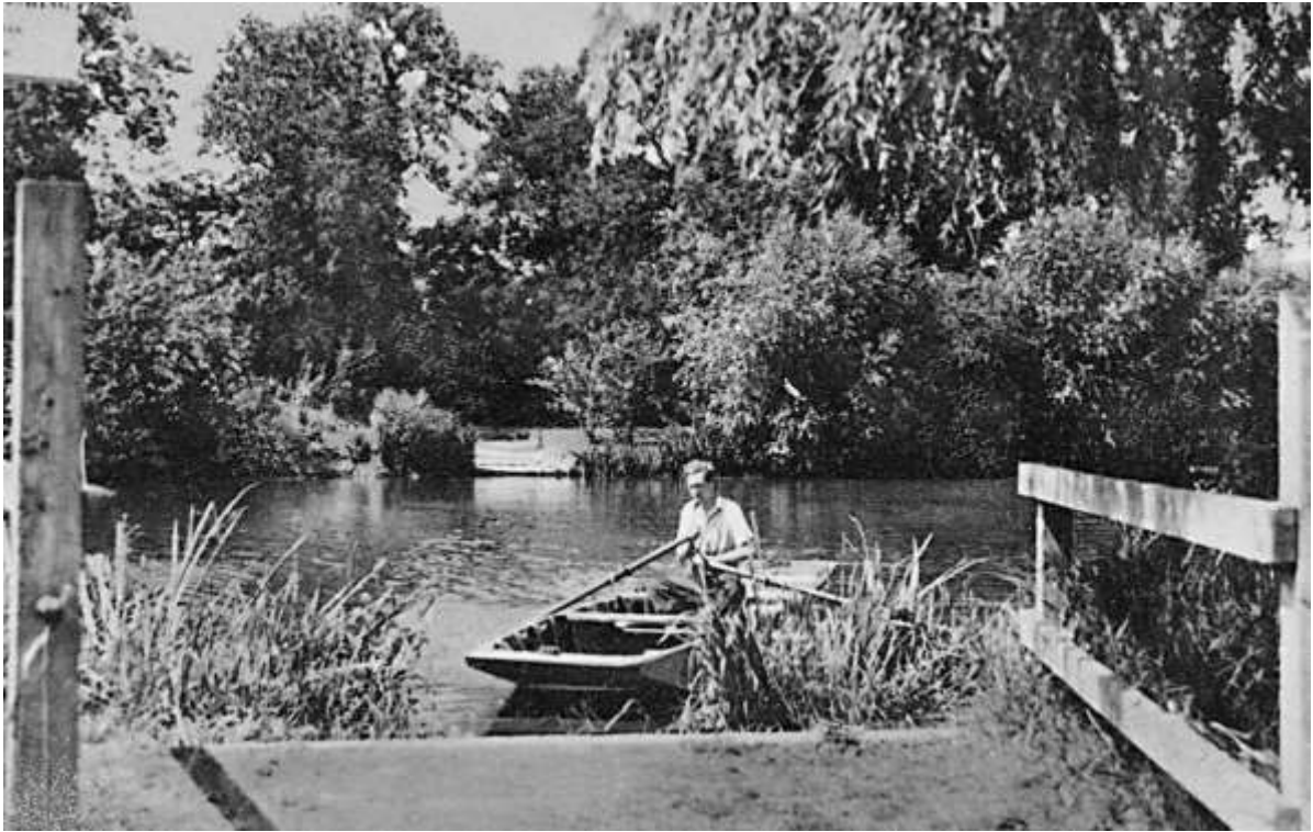
One of the ferries which once crossed The Thames at Benson