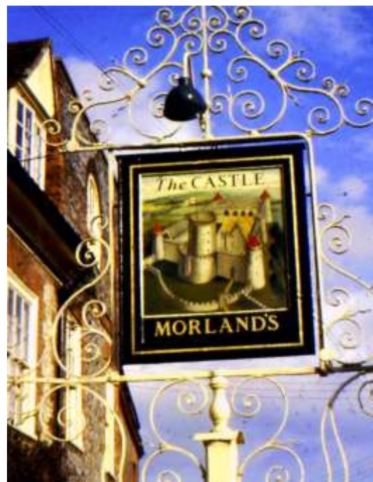
The magnificent sign in the 1960