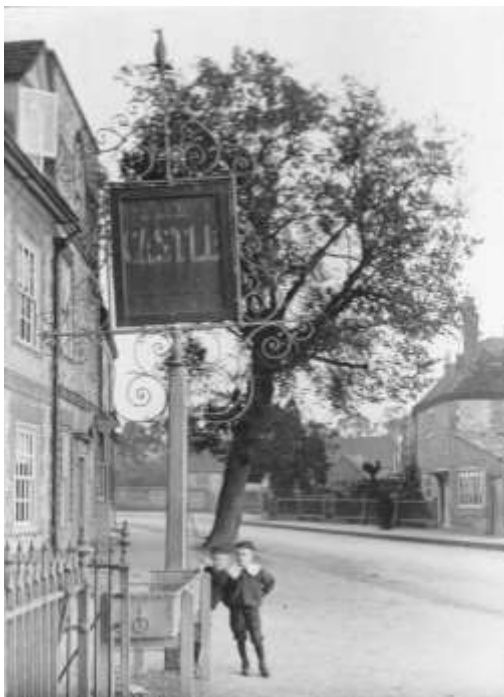
The Castle with its horse trough